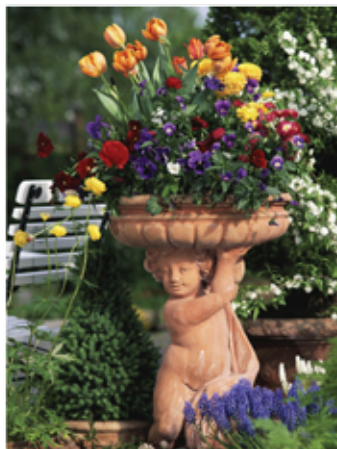
THE POTTED GARDEN: A guide to the season's best indoor plants, herbs, and edibles. BY ANNE-MARIE ROY