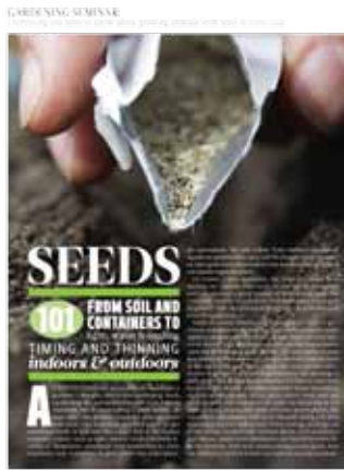
HOW TO MAKE: Planning your indoor home garden for spring? Here's our guide to take your planning to planting day. BY ANNE-MARIE ROY